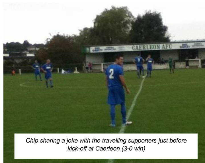
Chip sharing a joke with the travelling supporters just before kick-off at Caerleon (3-0 win)