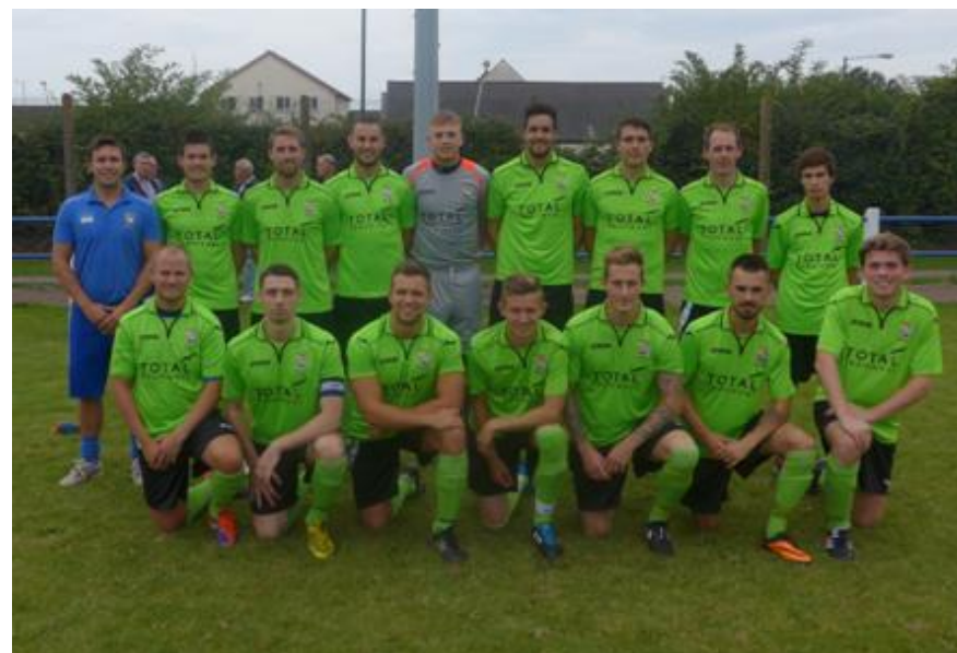
First team squad that faced Cambrian & Clydach Vale in a pre-season friendly